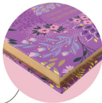
Gold Gilt Page Edges