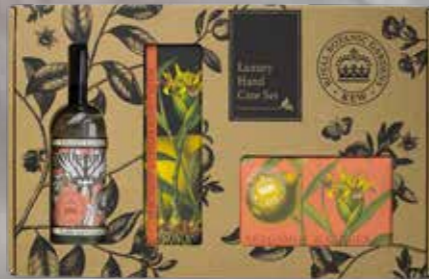
Bergamot & Ginger KGG008