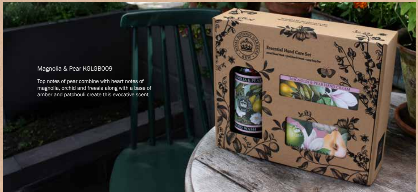
Magnolia & Pear KGLGB009

A fresh, bright fragrance with Stephanotis jasmine and orange flower, complemented by fruity top notes of wild strawberry, peach, kiwi, and banana.