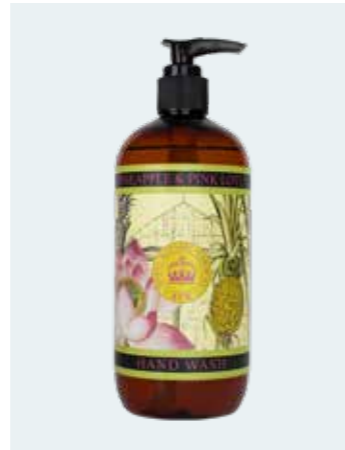
Pineapple & Pink Lotus KGL0014