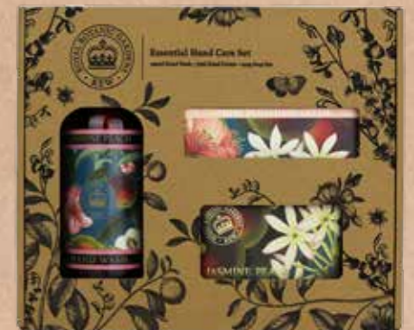
Jasmine Peach KGLGB017

A subtle and exotic floral fragrance with top notes of bergamot and peppercorn. Delicate notes of peony, apricot and osmanthus complement the warm base of musk and patchouli.