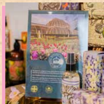
INFORMATION POSTERS A4 (POK02) OR A5 (POK3)