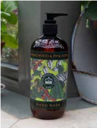
Sandalwood & Pink Pepper KGL0005