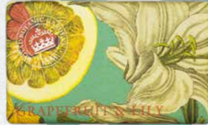
Grapefruit & Lily KGS0003