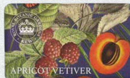
Apricot Vetiver KGS0018