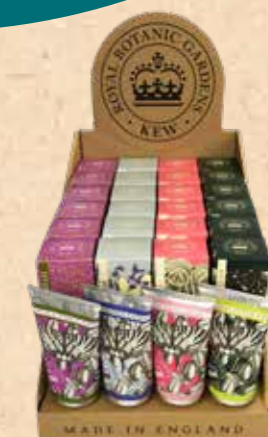
CDU2 HAND CREAM CDU HOLDS 4 CASES