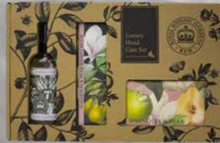
Magnolia & Pear KGG009