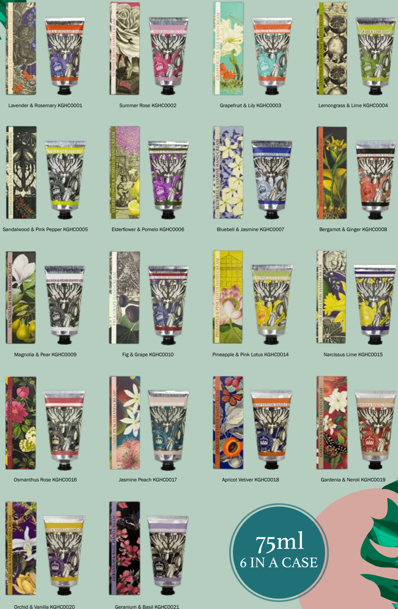
Lavender & Rosemary KGHC001 Summer Rose KGHC002 Grapefruit & Lily KGHC003 Lemongrass & Lime KGHC004 Sandalwood & Pink Pepper KGHC005 Elderflower & Pomelo KGHC006 Bluebell & Jasmine KGHC007 Bergamot & Ginger KGHC008 Magnolia & Pear KGHC009 Fig & Grape KGHC010 Pineapple & Pink Lotus KGHC014 Narcissus Lime KGHC015 Osmanthus Rose KGHC016 Jasmine Peach KGHC017 Apricot Vetiver KGHC018 Gardenia & Neroli KGHC019 Orchid & Vanilla KGHC020 Geranium & Basil KGHC021

CDU2 Hand Cream HOLDS 4 CASES (24 UNITS)