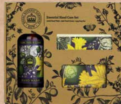
Narcissus Lime KGLGB015

A balance of citrus and spice evokes the scents of the Mediterranean. A floral heart of rose, complemented by a rich base of patchouli and musk.