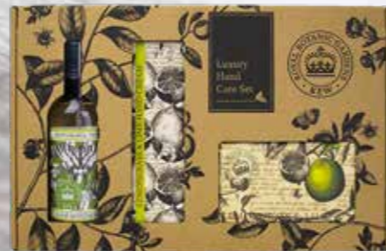
Lemongrass & Lime KGG004

There are eight fragrances to choose from. All Contain 1x 100ml Hand Sanitiser, 1x 240g Soap Bar & 1x 75ml Hand Cream. 2 in a case.