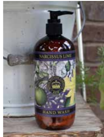
Narcissus Lime KGL0015