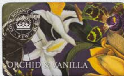
Orchid & Vanilla KGS0020