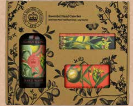
Bergamot & Ginger KGLGB008

A meadow fresh fragrance with notes of bluebell, jasmine and hyacinth. Rose complements a soft base of musk to create this delicate fragrance.