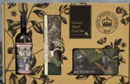
Fig & Grape KGG010