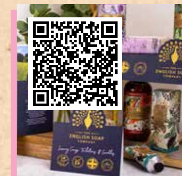
SCAN HERE TO VIEW THE FULL POS BROCHURE