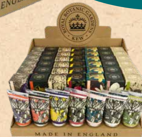
CDU1 HAND CREAM CDU HOLDS 7 CASES