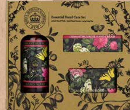
Osmanthus Rose KGLGB016

A floral fragrance with top notes of lime, bergamot and pear. Notes from jasmine, orange blossom, tuberose and narcissus form the heart of the scent and come together on a base of vanilla and sandalwood.