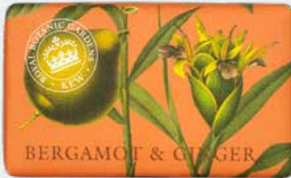
Bergamot & Ginger KGS0008