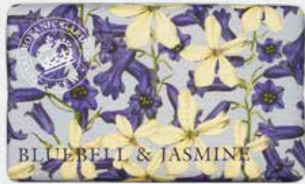
Bluebell & Jasmine KGS0007