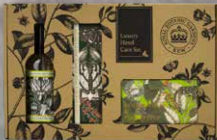
Sandalwood & Pink Pepper KGG005