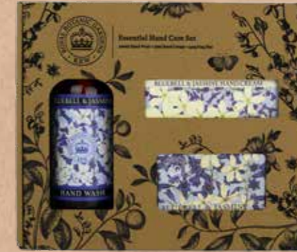
Bluebell & Jasmine KGLGB007

A zesty blend of citrus combined with the freshness of lemongrass, creates a balanced and uplifting fragrance.