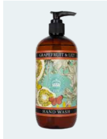
Grapefruit & Lily KGL0003