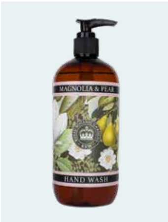
Magnolia & Pear KGL0009