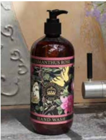
Osmanthus Rose KGL0016