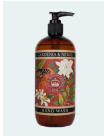
Gardenia & Neroli KGL0019