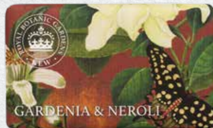
Gardenia & Neroli KGS0019