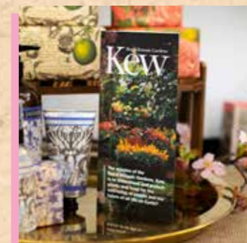
TRIANGLE TENT CARD 3 SIDED TENT CARD (POK01)