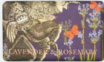
Lavender & Rosemary KGS0001