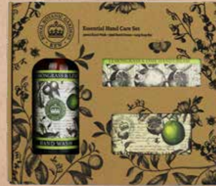
Lemongrass & Lime KGLGB004

Adorned with beautiful illustrations from the library and archives at the Royal Botanic Gardens, Kew, these thoughtfully designed gift boxes are perfect for treating a loved one or indulging yourself. Each box includes a 75ml hand cream, a 240g soap bar, and a 500ml hand wash. 2 in a case.