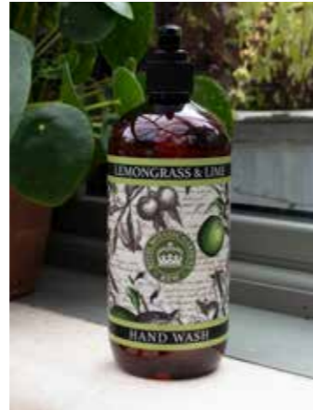
Lemongrass & Lime KGL0004