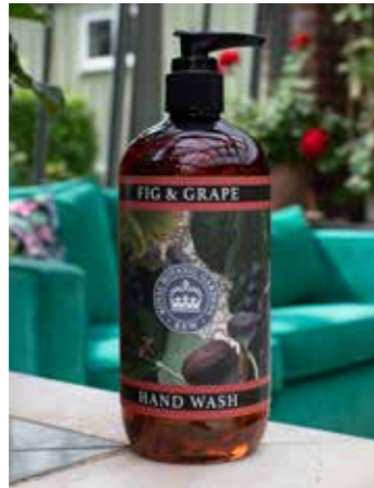
Fig & Grape KGL0010