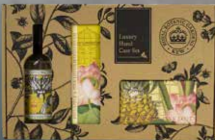
Pineapple & Pink Lotus KGG014