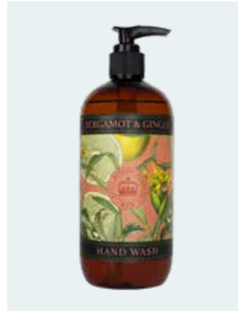
Bergamot & Ginger KGL0008