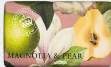
Magnolia & Pear KGS0009