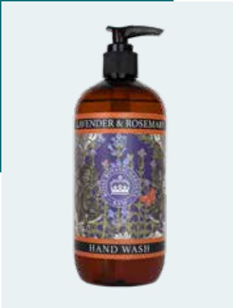
Lavender & Rosemary KGL0001