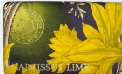
Narcissus Lime KGS0015