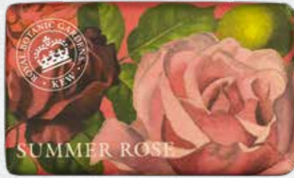
Summer Rose KGS0002