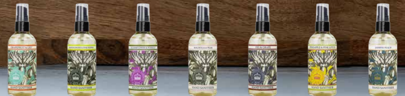
Grapefruit & Lily KGA003