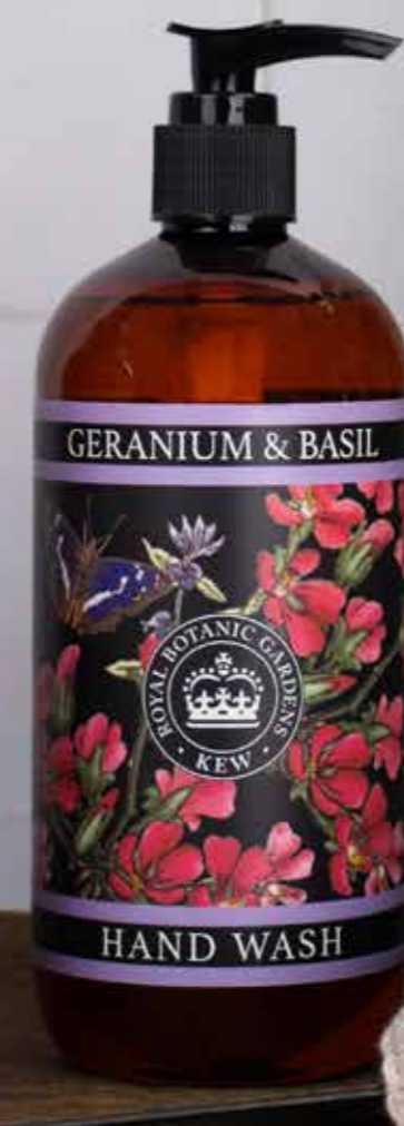
Orchid & Vanilla KGL0020 Geranium & Basil KGL0021