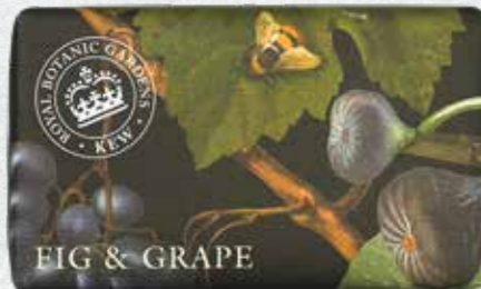
Fig & Grape KGS0010