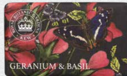
Geranium & Basil KGS0021