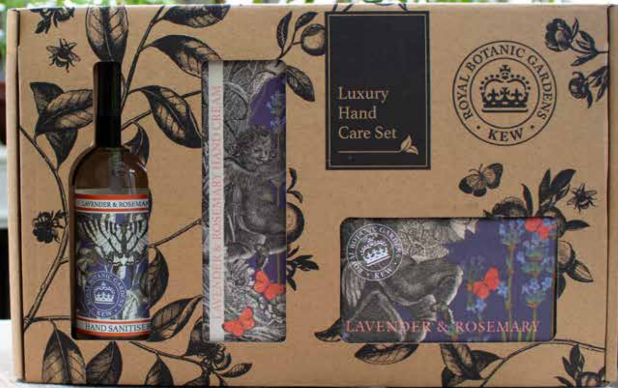
Lavender & Rosemary KGG001