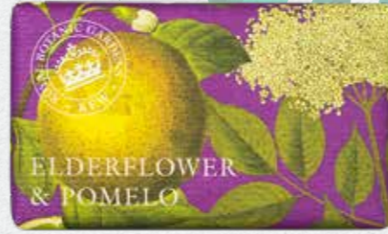
Elderflower & Pomelo KGS0006