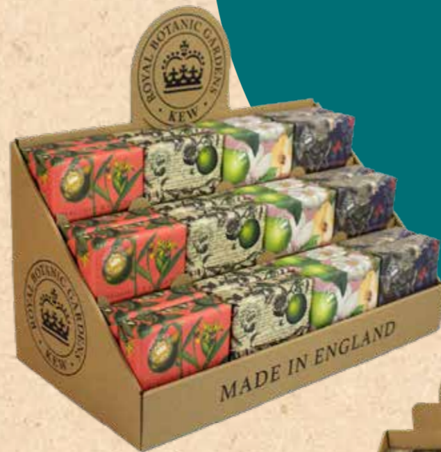
CDU3 SOAP BAR CDU HOLDS 4 CASES (24 SOAP BARS)

Designed to accommodate all our soap bars, this pouch maximizes lather and extends the soap's lifespan.