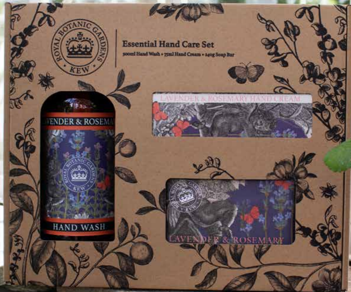
Lavender & Rosemary KGLGB001