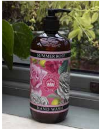
Summer Rose KGL0002