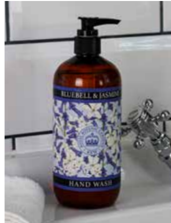
Bluebell & Jasmine KGL0007