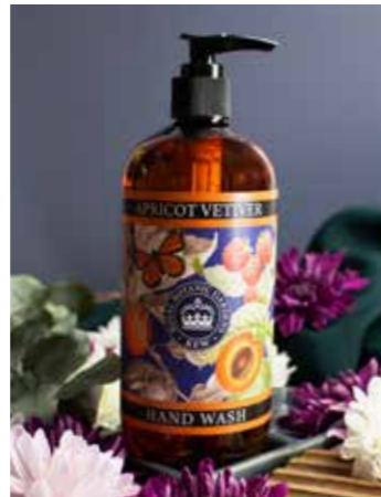
Apricot Vetiver KGL0018