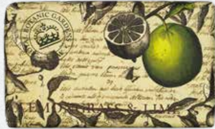
Lemongrass & Lime KGS0004