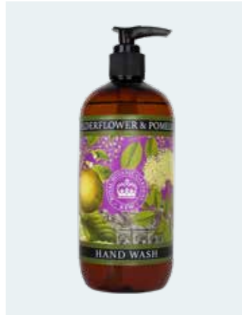
Elderflower & Pomelo KGL0006