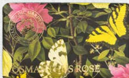
Osmathus Rose KGS0016